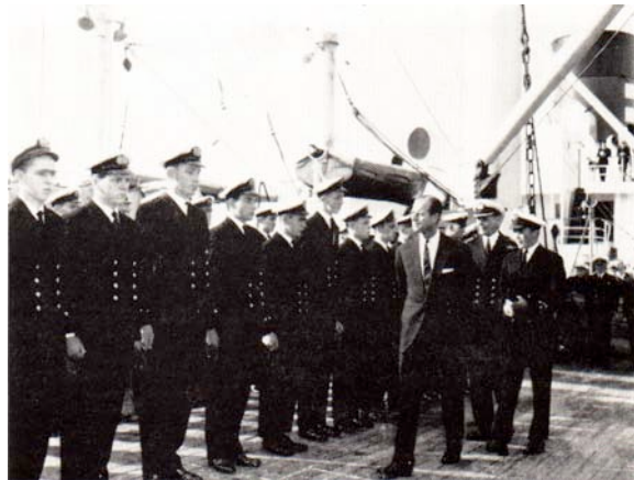
H.R.H. inspects 'Durham' Cadets.