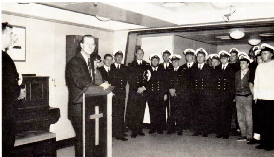
H.R.H. addresses Cadets in 'Otaio'.

The idea of inviting Prince Philip to visit one or more of the Cadet Training Ships was mooted some twelve to eighteen months ago but we had to wait for the right opportunity to develop before applying for a 'Royal Visit'. When it was realised that Durham , at the end of her last voyage as a Cadet Training Ship, and Otaio would be virtually alongside one another in the Royal Albert Dock, it was decided, despite the short notice, to make a formal application to Buckingham