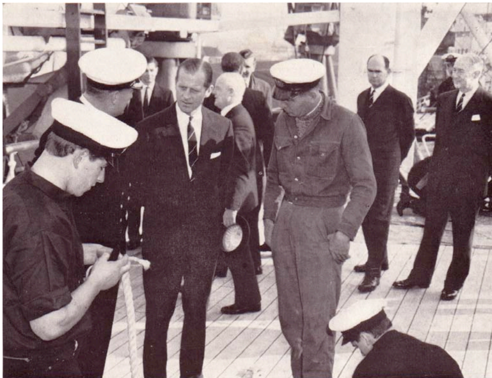
Inspecting Cadets at work.

Palace (H.R.H's Private Secretary) asking if His Royal Highness would honour us by taking the final inspection of Durham Cadets and inspecting Otaio . Needless to say, we were all delighted when Prince Philip accepted the invitation.