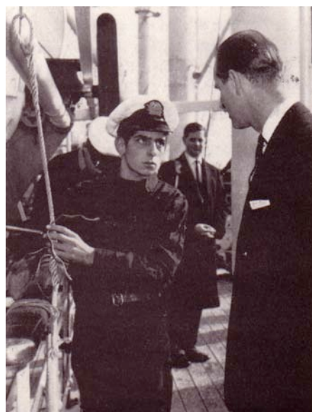
H.R.H. with Cadet Oakshot.

During the three weeks that followed, increasing activity was witnessed in Gravel Lane (some say that more dust was raised than by the demolition squads in Leadenhall Street), the Dock Office and the two Cadet Ships. Preparations included visits and numerous telephone calls to Buckingham Palace (a private line would have been fun) and of course a dress rehearsal on board the ships – the scene was set.