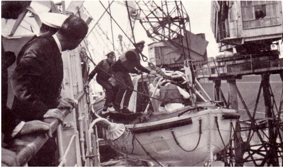
Rescue Boat about to be launched.