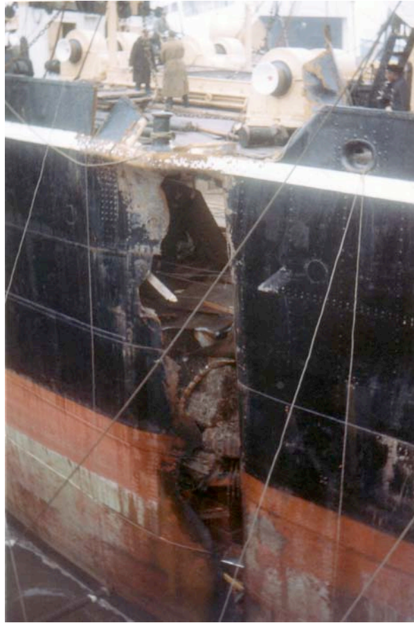
Chantala in Dry-dock

flood with 25 ft of water before Chippy could reach for his sounding rod. That action was a travesty of good seamanship.