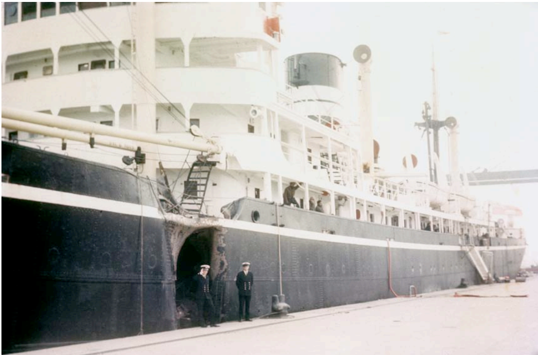
Chantala at Tilbury – Prior to Dry-docking (2)

On our way up river to Tilbury, Thames Radio was broadcasting our position and predicament under control of four or five tugs as I recall. It was quite amusing to see the ships coming down river suddenly realise it was us, and, as they had been requested to pass at slow speed, grabbing their telegraphs all too late. Everybody on our bridge would run out to the port side to watch the wash splash up the gapping hole!!